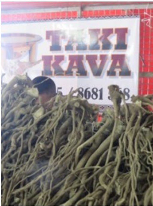
Raw kava plant