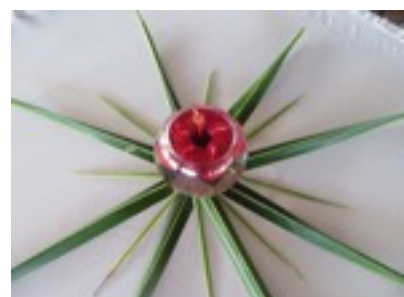
Table decoration at Faimafili Village Resort and Restaurant, Samoa