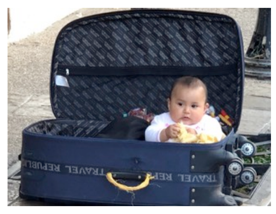
Another way to travel -- luggageclass!