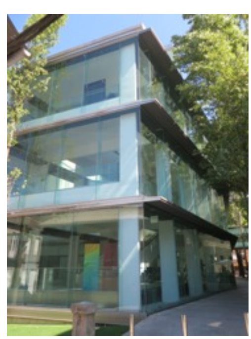
The main building of the Pontevedra Museum

This is one of the best museums I've ever visited. I am able to enjoy only two of its six buildings - so there is good reason to return! Everything is beautifully displayed and lighting is motion sensitive, so as I approach a series of works, spotlights go on. In addition to saving electricity, this will, over time, save the artworks from fading. I didn't spend too much time in the 14th and 15th century galleries, as this is mostly religious art, but from the 16th century on - the works are fantastic.