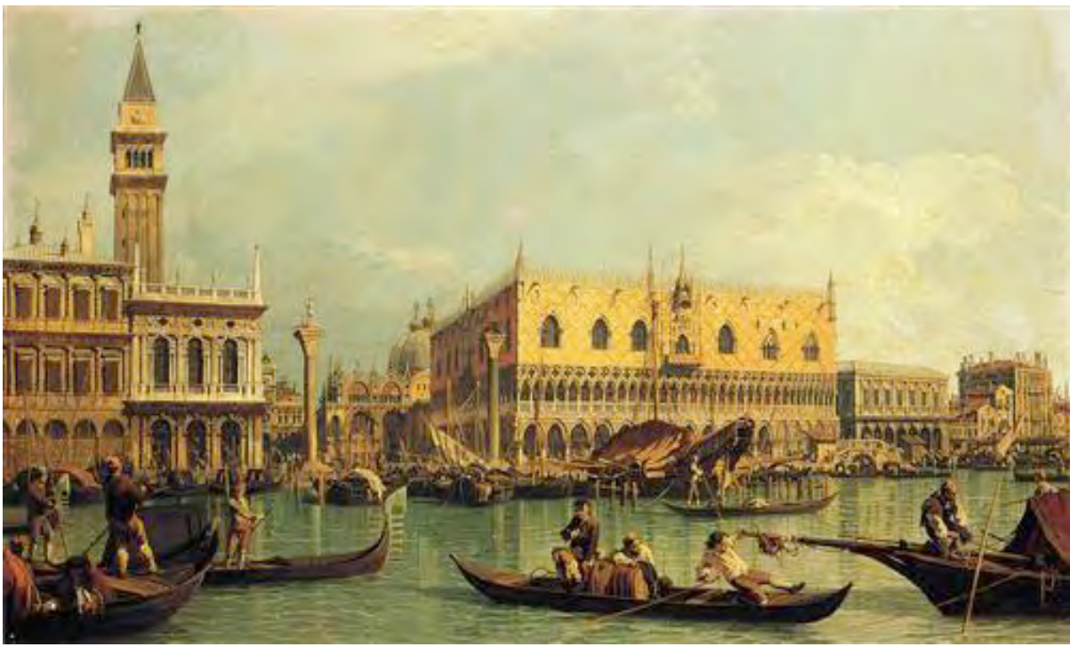
Canaletto. View of the Doges Palace, 1737