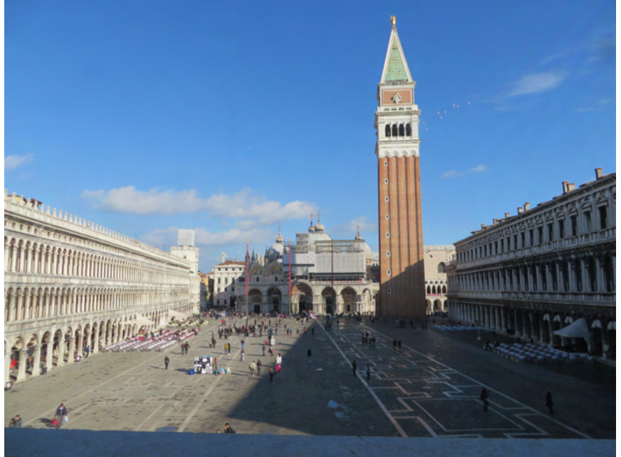
The Plaza San Marco. This is the view from the restaurant in the San Marco Museum, a great place for a light lunch and cappuccino.

Come to find out, there is only ONE plaza in all of Venice - the Plaza San Marco. All the other little squares are called "campo." We pay special attention to street names and soon find "Rio" as part of a street name signifies that the walkway used to be a river and now is a filled-in canal; "Calle" isn't a street, it is a path; "Fondamenta" is a sidewalk along the edge of a canal. But in reality, none of this matters as maps here are just a suggestion. Venice is the best place in the world to let yourself get lost. We are given the advice to just keep on walking and sooner or later, we'll come across the Grand Canal and a convenient vaporetto stop