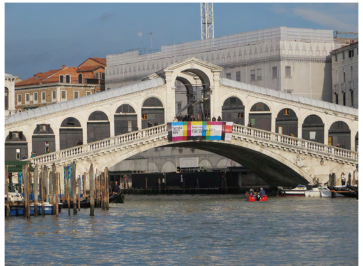
The beautiful Rialto Bridge

I check in to the lovely Antiche Figure Hotel, with its better-than-perfect location across the Grand Canal from the train station and within steps of a vaporetto (water bus) stop. This hotel was recommended on Cruisecritic.com and it did not disappoint. More about the hotel later.